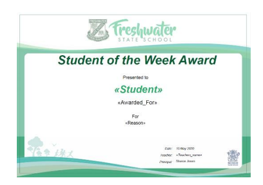
Student of the Week