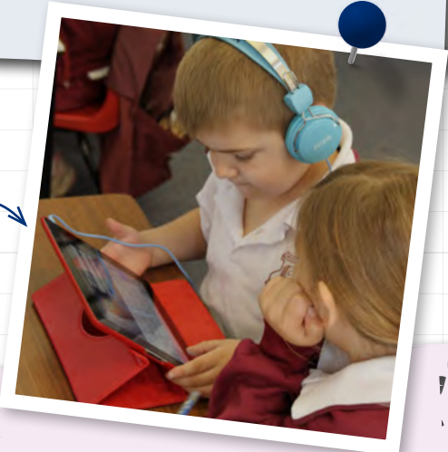
Uses a tablet to sequence steps