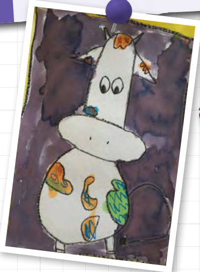
Creates artworks by drawing and painting